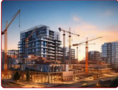
01. Infrastructure / Construction