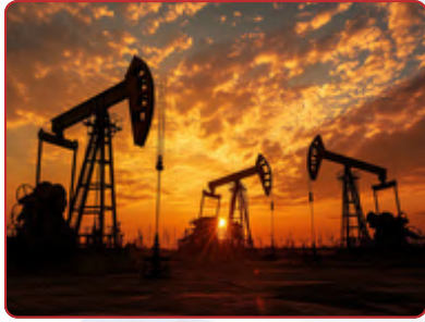
04. Oil & Gas