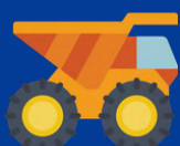
Rigid Dump Truck