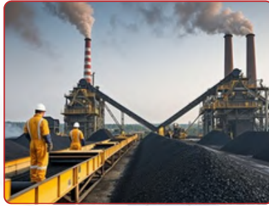
02. Mining & Crushing