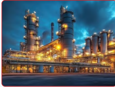
05. Power / Energy